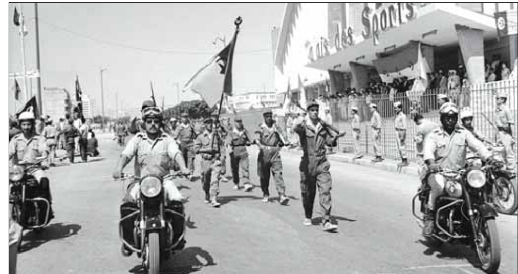
File photo taken on July 3, 1962, shows Algerian troops of the National Liberation Army (ALN) parade in front of the Palais de Sports in Oran, during a ceremony celebrating Algeria’s independence.

first presidential campaign in February 2017, he described colonisation as a “crime against humanity”. He has since acknowledged the French army was behind the death of Algerian nationalist lawyer Ali Boumendjel and anti-colonialist French mathematician Maurice Audin.