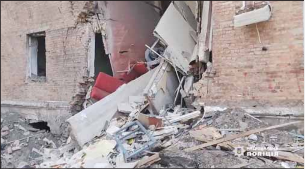
A view shows a damaged building in Bakhmut, Donetsk Oblast, Ukraine, in this still image obtained from a social media video released yesterday.

some of the heaviest fighting of the four-month-old war that pounded whole districts into rubble. Other settlements now face similar bombardment. “Private houses in attacked villages are burning down one by one,” Luhansk Governor Serhiy Gaidai said on Telegram, adding that shelling stopped Lysychansk residents from dousing fires. Troops on a break from the fighting and speaking in Konstyantynivka, a market town about 115km west of Lysychansk, said they had managed to keep the supply road to the embattled city open, for now, despite Russian bombardment. “We still use the road because we have to, but it’s within artillery range of the Russians,” said one soldier, who usually lives in Kyiv but asked not to be named, as comrades relaxed nearby, munching on sandwiches or eating ice cream. “The Russian tactic right now is to just shell any building we could locate ourselves at. When they’ve destroyed it, they move on to the next one,” the soldier said.