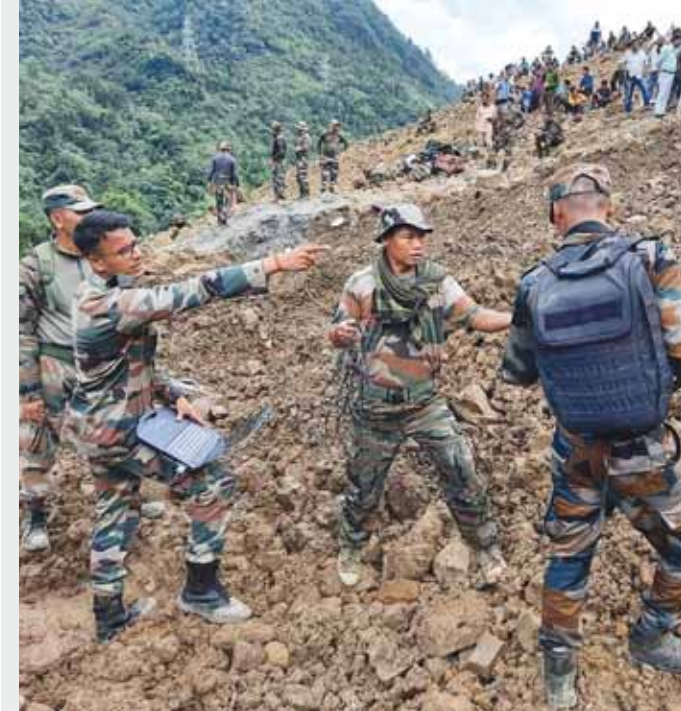
In this photo released yesterday by the Indian Army soldiers and disaster relief teams search for survivors after a landslide in Noney district, some 50km from Manipur’s capital Imphal.