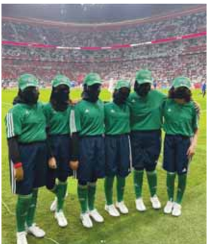
Durham girls got the opportunity to be part of the Arab Cup 2021 as FIFA flag-bearers.