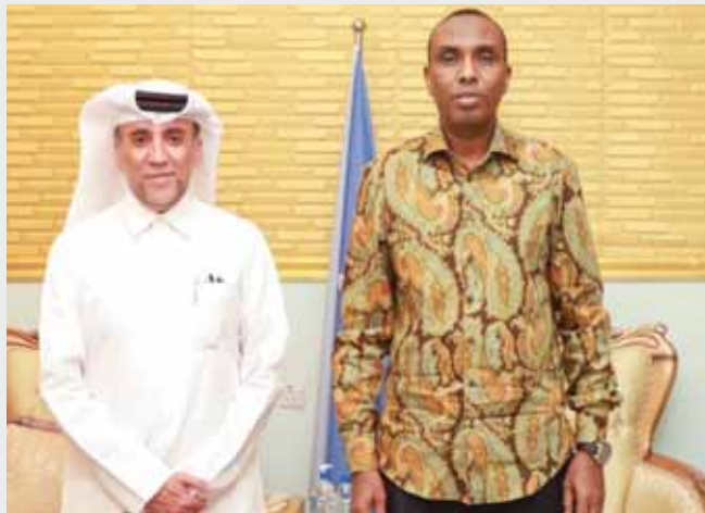
Somali Prime Minister Hamza Abdi Barre met with Qatar's ambassador in Mogadishu Hassan bin Hamza Hashem. The meeting reviewed bilateral relations. (QNA)