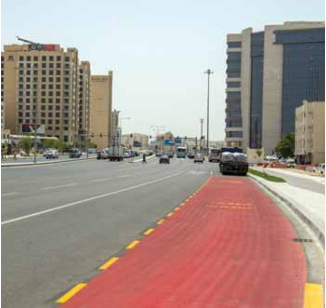
The Public Works Authority (Ashghal) has announced the designation of a special lane for buses, taxis and authorised vehicles on A-Ring Road, in order to facilitate traffic and serve the FIFA World Cup 2022 transportation plan.