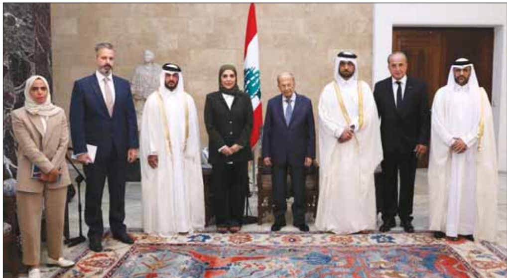
The Lebanese president expressed his hope for fruitful co-operation between the Arab Network and the Lebanese Commission for Human Rights.

She said, "The presence of Lebanon within the network will enable it to interact with Arab