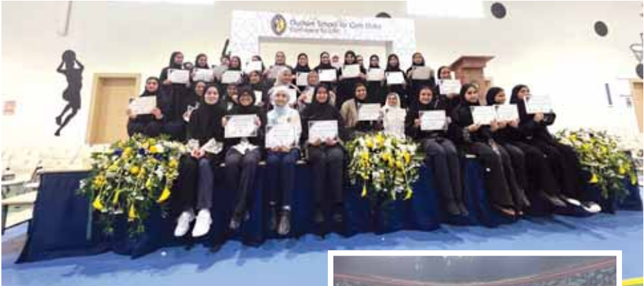
Students celebrate their accomplishments.

The opportunity to be part of the Arab Cup 2021 as FIFA flag-bearers in group games and represent their country on the world stage was a special one, as they were also chosen for the final played in front of more than 60,000 people. On an individual level, a Year 10 student was selected to represent the Qatar national women's football team in a recent friendly match, while a student in Year 12 was an integral member of the successful Qatar national debate team in several international competitions. Students have also become published authors and created in-house newspapers. Durham School for Girls said it is "proud of these wonderful examples of students making a difference and pushing themselves to shine". The school's merit reward system has seen a number of girls achieve bronze and silver