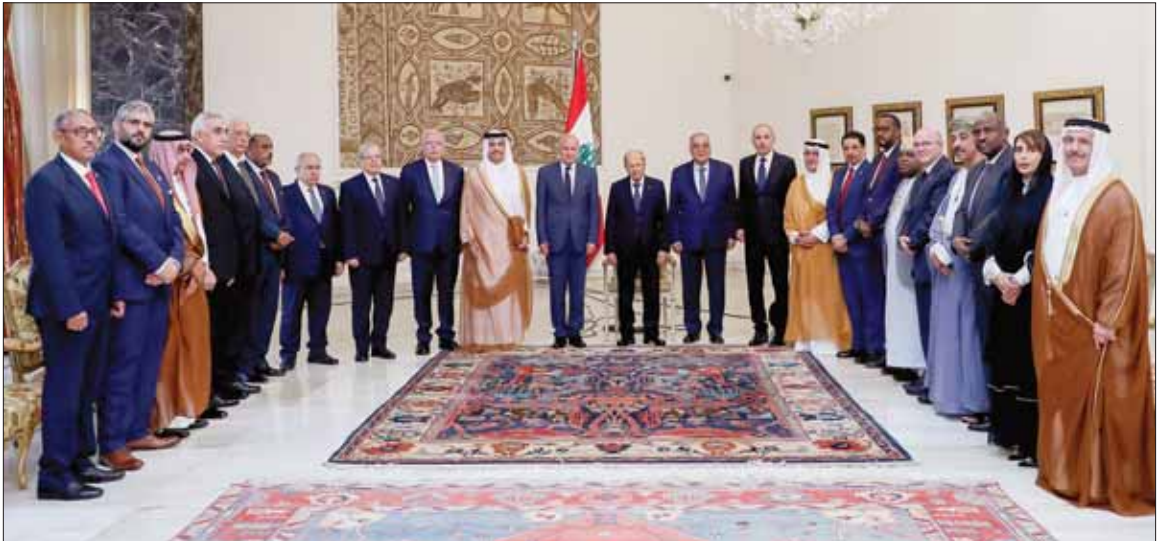
HE the Deputy Prime Minister and Minister of Foreign Affairs Sheikh Mohamed bin Abdulrahman al-Thani participated yesterday in Lebanese President Michel Aoun's meeting with the Arab foreign ministers who are participating in the Arab Ministerial Consultative Meeting in Beirut. (QNA) Page 2