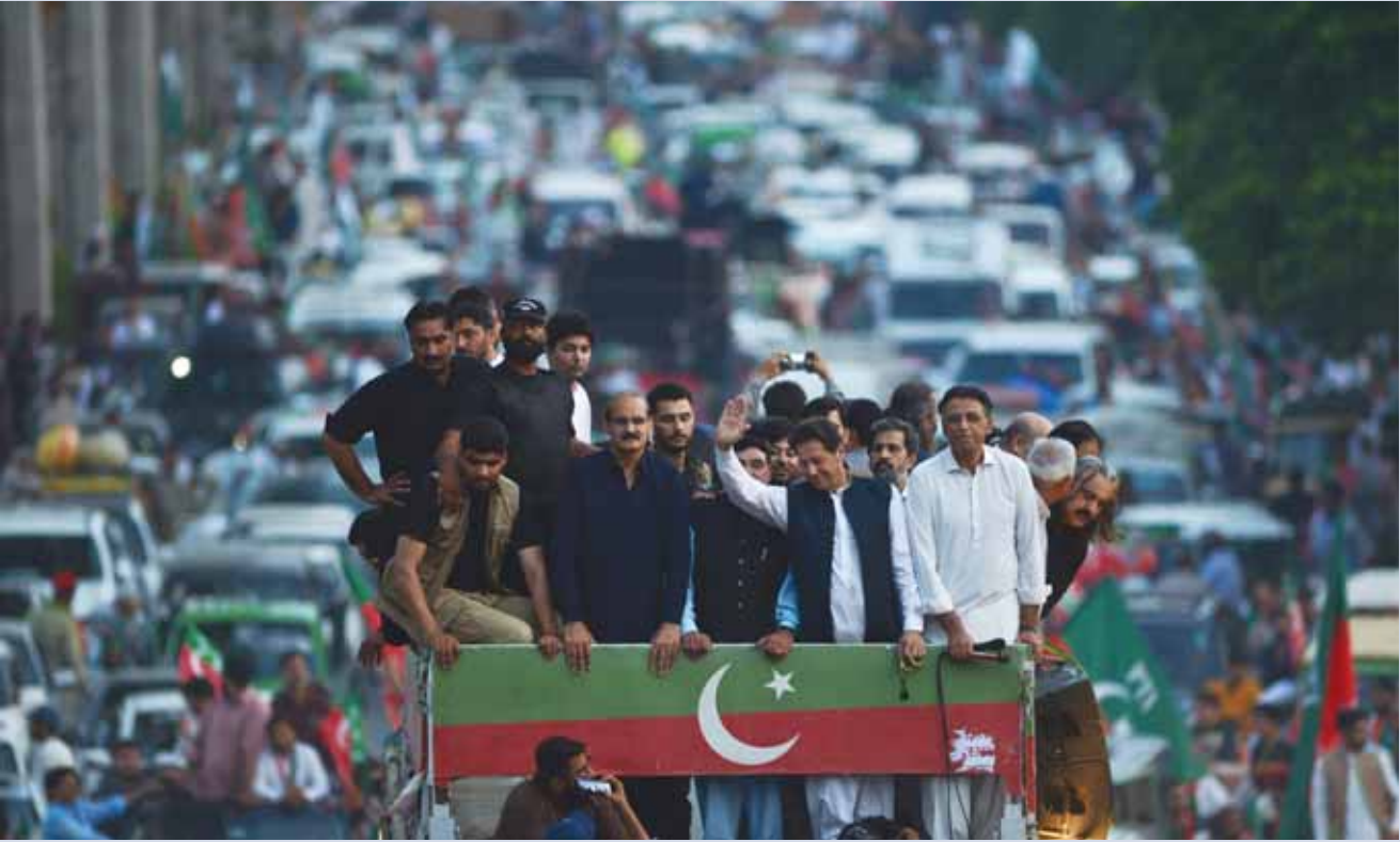
Former prime minister and leader of the opposition Pakistan Tehreek-e-Insaf (PTI) Imran Khan (front second right) waves to supporters during a protest rally against inflation, political destabilisation and continued hikes in fuel prices, as it passes towards Islamabad’s Parade Ground yesterday. Later, during his address, Khan warned his party supporters to be ready for the 20 provincial assembly by-elections to be held in Punjab this month, alleging that the ruling Pakistan Muslim League-Nawaz (PML-N) would indulge in rigging to secure the seats that were vacated following the de-seating of his party’s 25 legislators — as mandated under the constitution — after they had switched sides and voted for the PML-N nominee for the chief minister’s election.