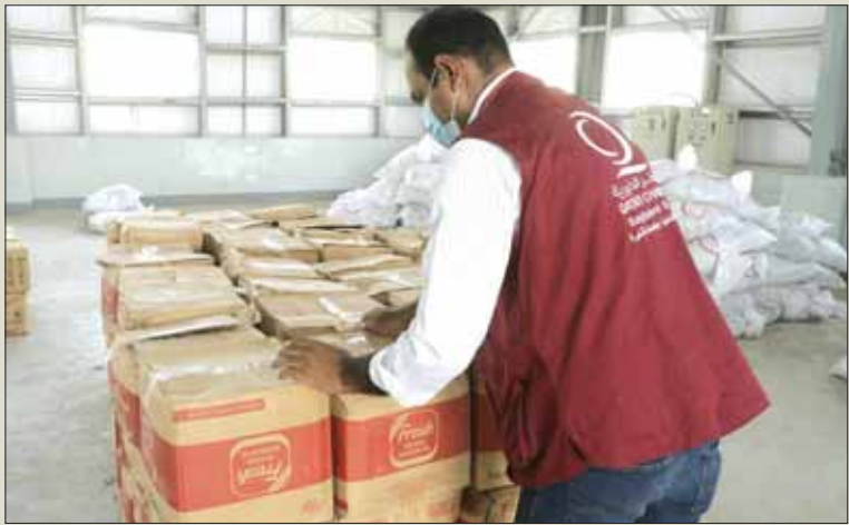
Recently, Qatar Charity distributed essential food items and gas cylinders among refugees, which benefited 15,442 people.