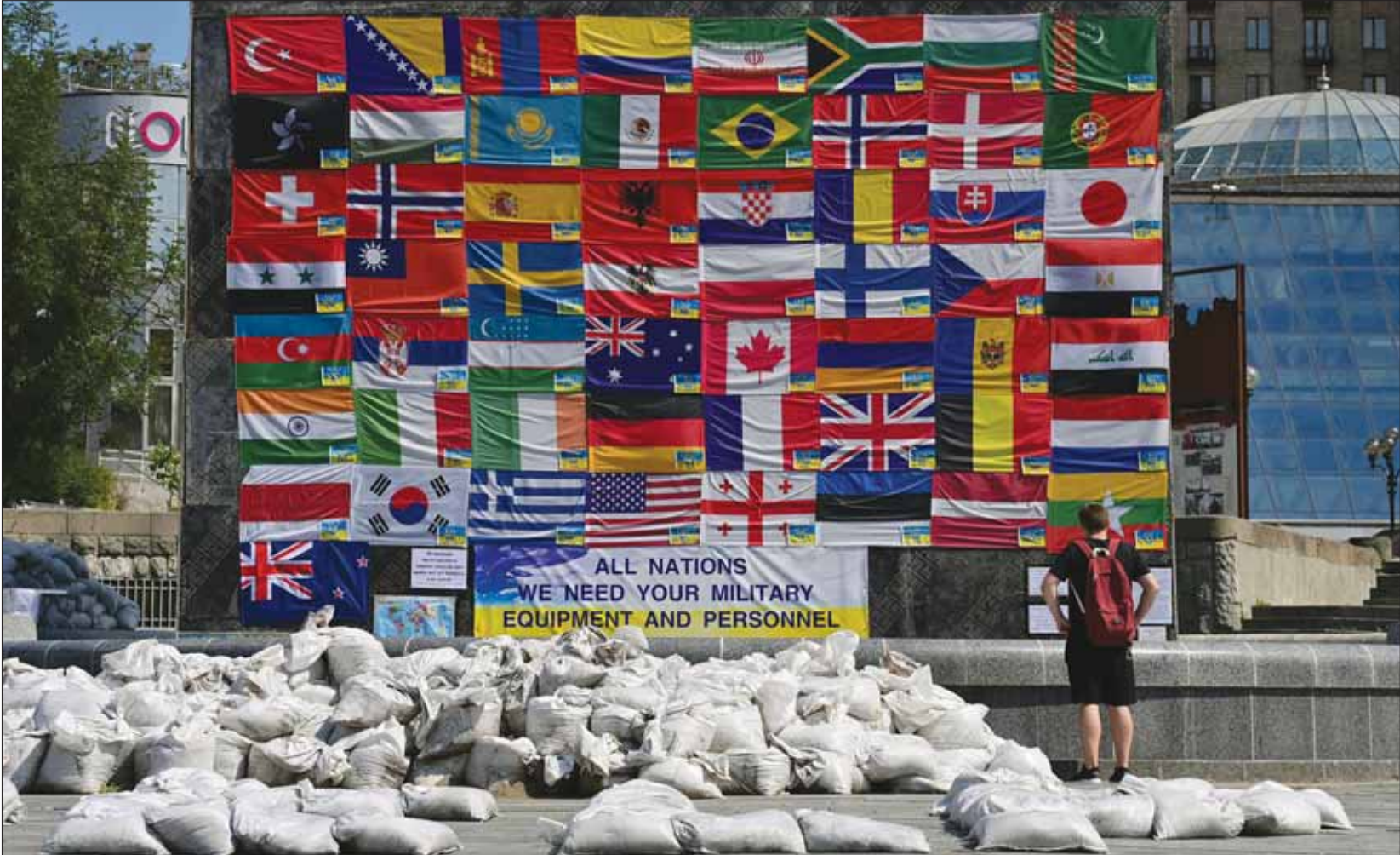
A man stands past on the ground as he looks at a wall with flags from all over the world and a poster reading “All nations, we need your military equipment and personnel” in Kyiv last week.

● Mark Leonard, Director of the European Council on Foreign Relations, is the author of The Age of Unpeace: How Connectivity Causes Conflict.