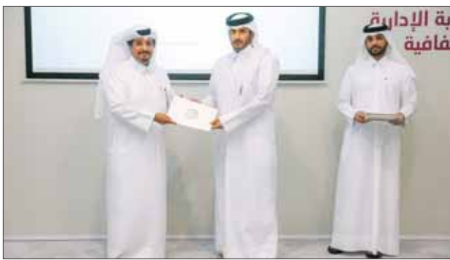
The programme combines theoretical and practical aspects in an interactive training.

It combined theoretical and practical aspects in an interactive training, in which each participant gained theoretical knowledge and practice, and where the participant is guided on how to apply this knowledge and skills in a practical way in his job, in addition to providing the trainees during the theoretical training with theories, as well as national and international standards regarding the