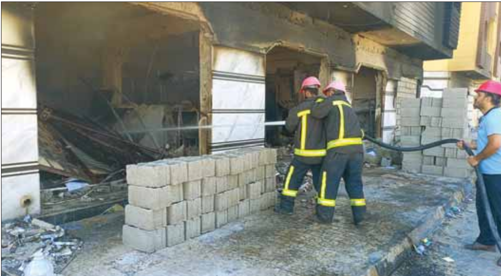
Libyan firefighters extinguish a flame at the House of Representatives in the eastern city of Tobruk yesterday, after angry protesters stormed the building ransacking its offices and torching part of it.

UN-mediated talks in Geneva this week aimed at breaking the deadlock between rival Libyan institutions failed to resolve key