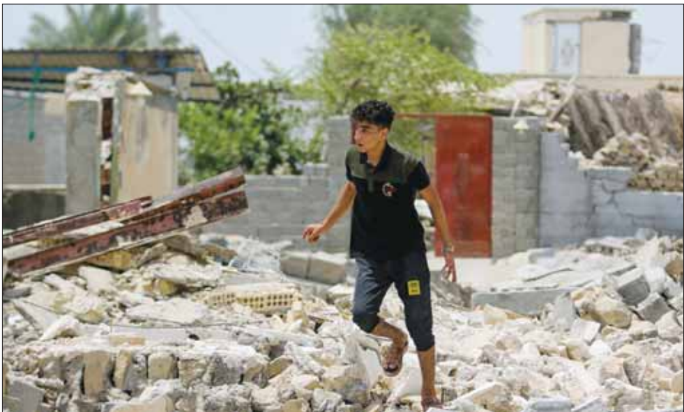
An Iranian man walks amid the rubble after an earthquake in Sayeh Khosh village in Hormozgan, yesterday.