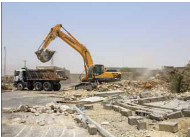
An excavator removes rubble after an earthquake in Sayeh Khosh village in Hormozgan.

was seen sifting through debris and trying to recover their belongings, as a woman was heard screaming in the background.