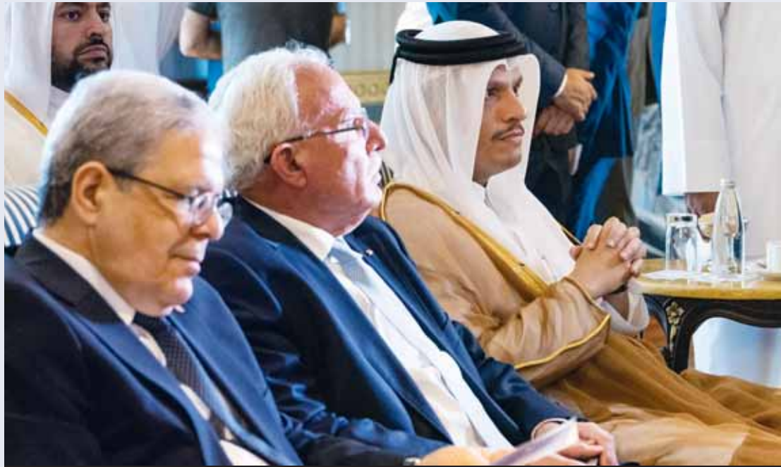
Qatar participated in the consultative meeting of Arab foreign ministers, which was held yesterday in Beirut. Qatar's delegation to the meeting was headed by HE the Deputy Prime Minister and Minister of Foreign Affairs Sheikh Mohamed bin Abdulrahman al-Thani.