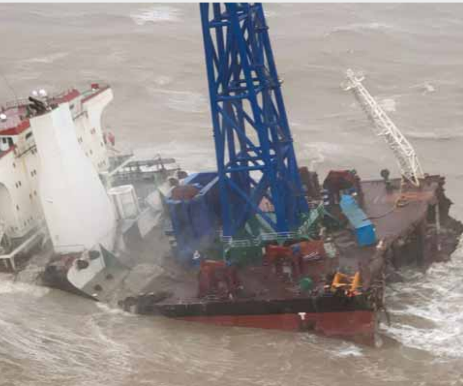
This handout photo taken and released by the Hong Kong Government Flying Service yesterday shows a ship after it broke into two amid Typhoon Chaba, during a rescue operation of the crew members in the South China Sea, 160 nautical miles southwest of Hong Kong.