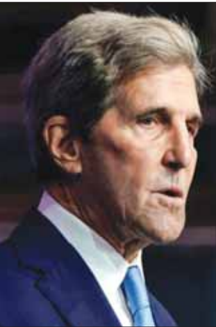
DETERMINED: John Kerry.